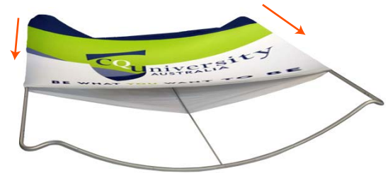
5. Pull pillowcased graphic over the frame.