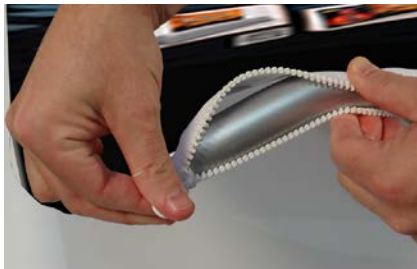
6. Zip up the bottom of graphic.