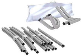
1. Unpack all parts.

Note: Assembly is the same for all sizes of curved Companion LT displays