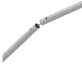
2. Assemble banded poles.