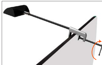
7. Clamp optional lights on top bar. Tip: Put lights on before standing the display up.